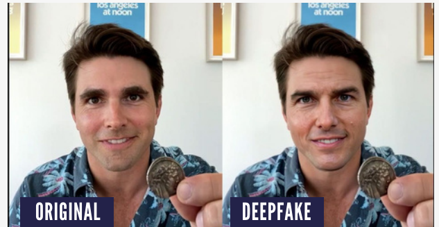
CREDIT: TIKTOK, DEEPPFAKE TOM CRUISE

These videos use face-swapping technology to transfer a victim's face from a photo or video onto the body of someone else in a pornographic video, making it falsely appear the victim is engaging in sex acts. To safely see how this technology works, click here to watch this explainer video created by Facebook.